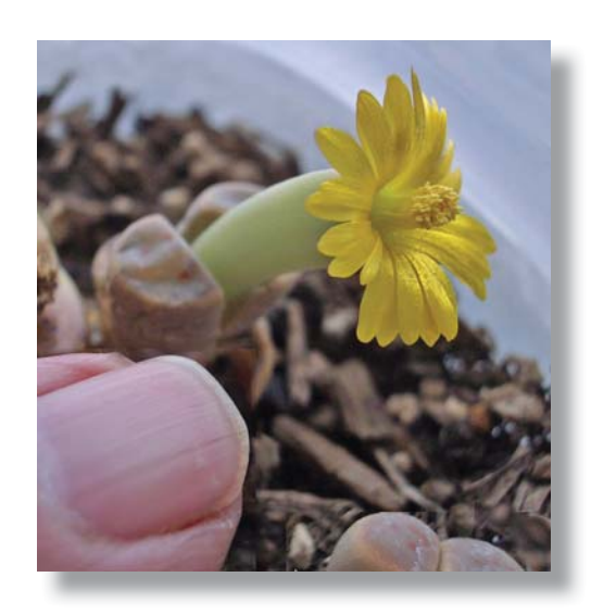
08 - Lithop in rare bloom.jpg