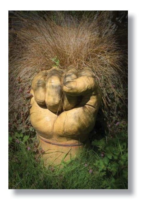
13 - Power to the garden.jpg