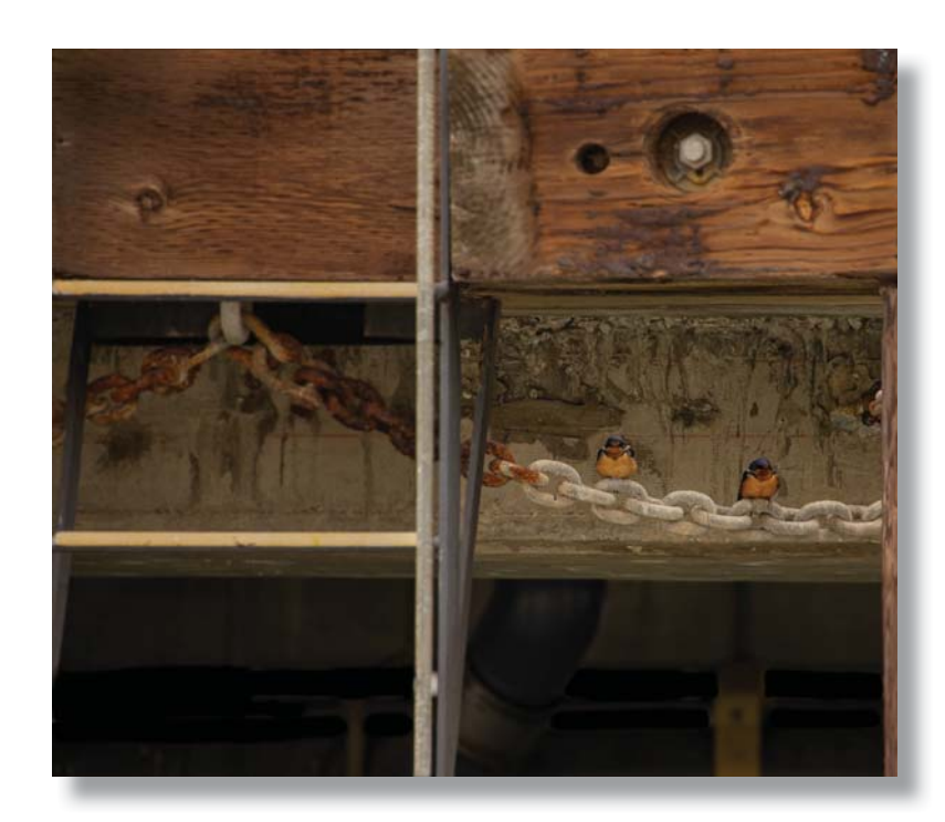
Barn Swallows Under Moss Landing Dock