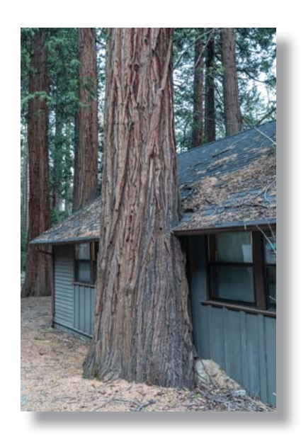
18 - Yosemite Tree Hugger PTCC.jpg